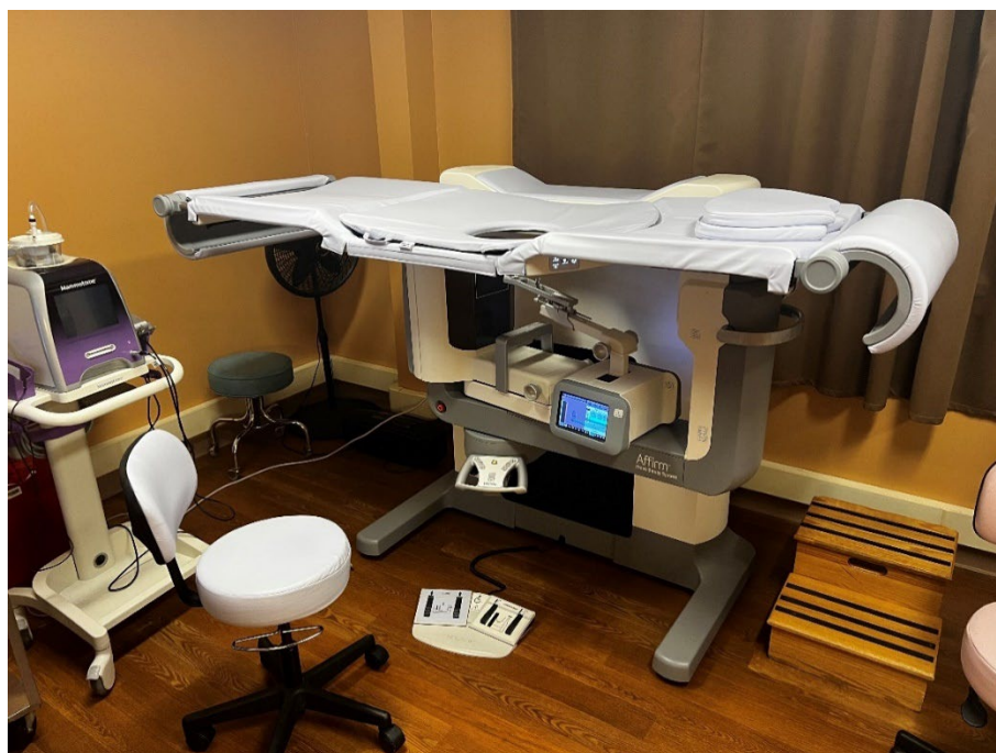
Stereotactic Exam Room and Biopsy