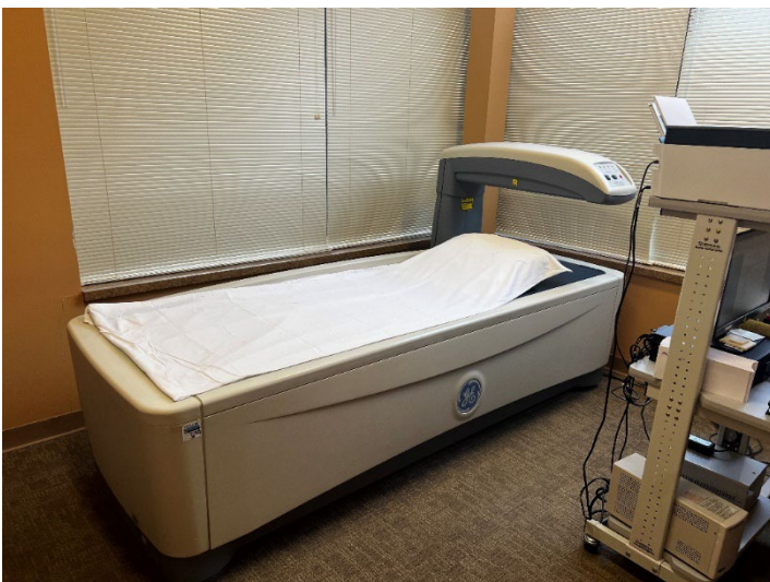
Bone Density Exam Room