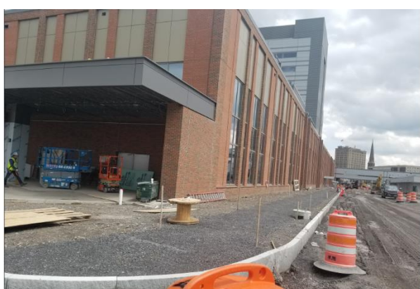
The north side parking lot is halfway completed.