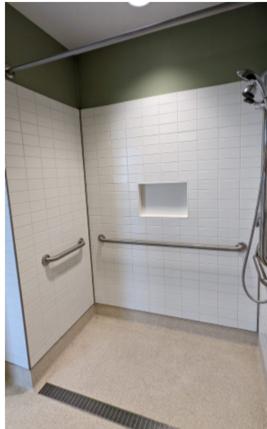
Intensive Care Unit Mockup Room