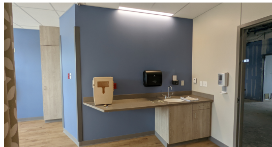
Labor & Delivery Mockup Room